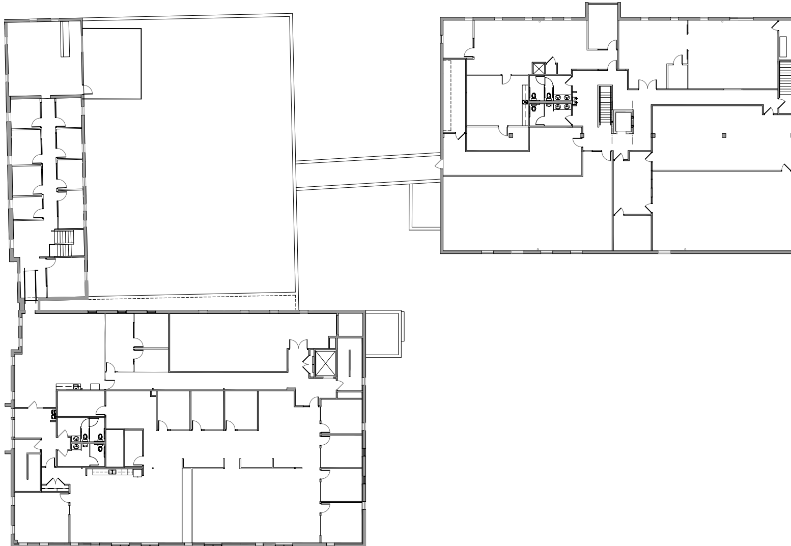
475 Old Highway 8 NW- second floor