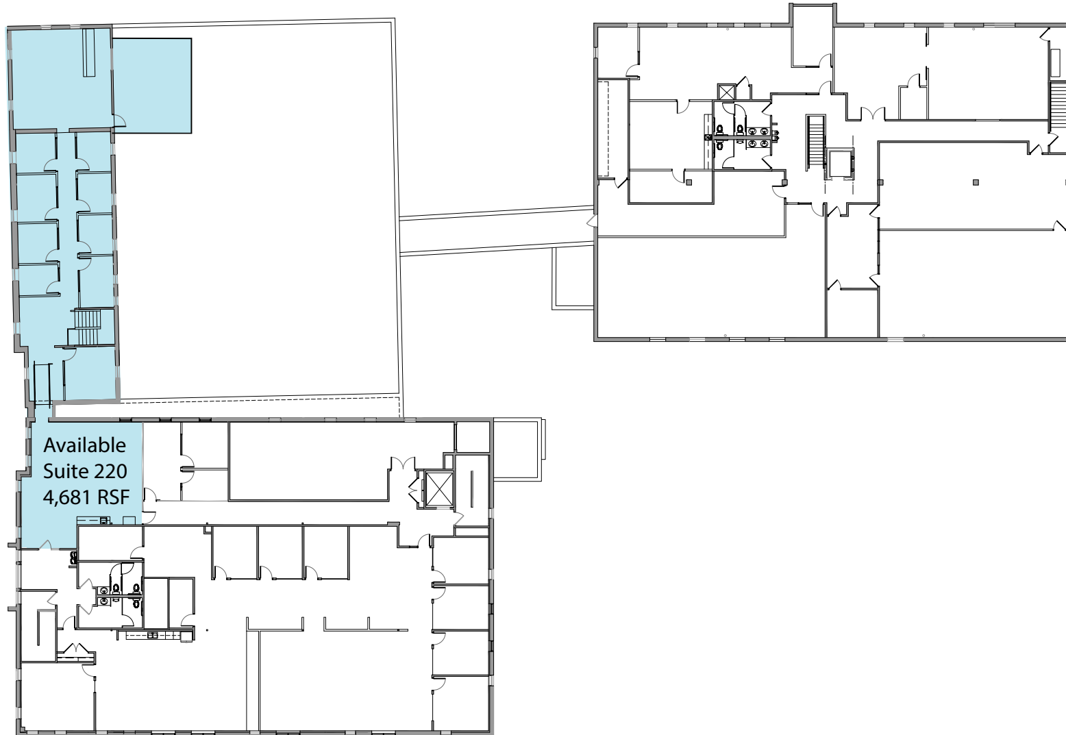
475 Old Highway 8 NW- second floor

Danny Gollin 612-623-2465 DannyG@hillcrestdevelopment.com